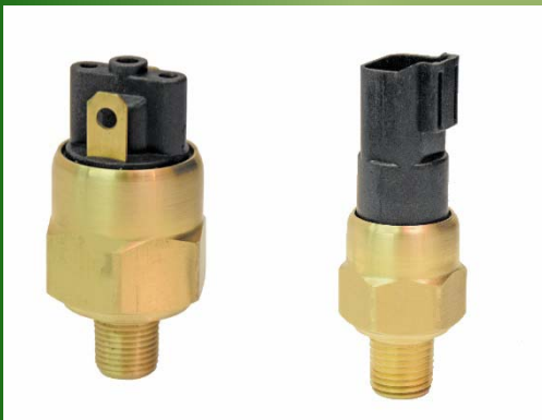
PVA / PVF (Creep Action)