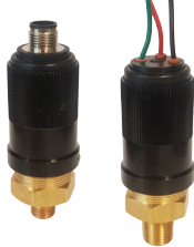
BMA / BMF Series