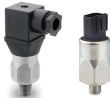
BPA / BPF Series