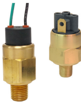
PMA / PMF Series PVA / PVF Series